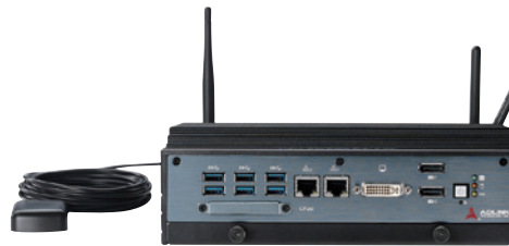
MXE-5400 with Antenna