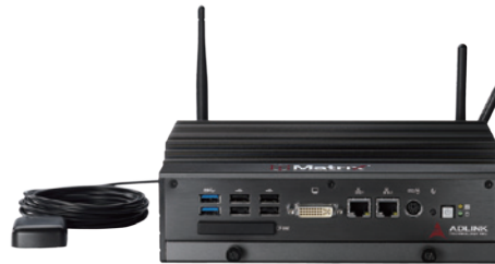
MXE-5300 with Antenna