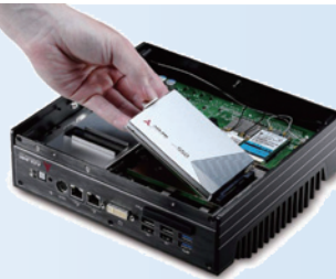
2. One screw removable storage bracket