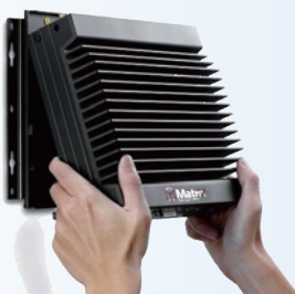
1. Ready-to-deploy wall mount kit