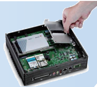
3. Flexible memory expansion slots