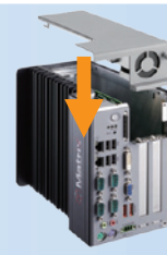
3. Replace it by plugging the hot-pluggable fan module cover into the fan connector on CPU board