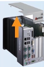
2. Withdraw the thumbscrew and remove the top cover