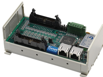
HSL-DII 6DO 16-US-NN