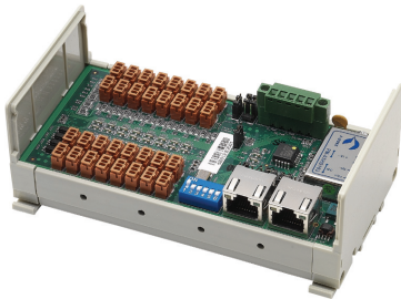
HSL-DII 6DO 16-UJ-NN